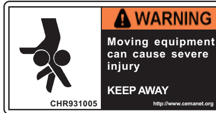
LOCATE ON INSPECTION DOOR (S)

To be located on conveyors where there are exposed moving parts which must be unguarded to facilitate function, i.e. rollers, pulleys, shafts, chains, etc.