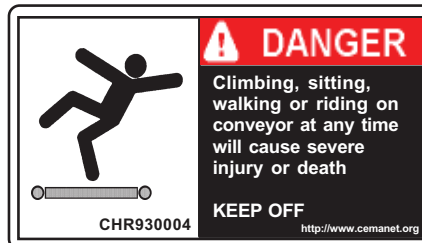
SPACE UP TO A MAXIMUM OF 50 FT CENTERS ( WALKWAY SIDES)

To be placed up to a maximum of 50' centers along the walkway side.