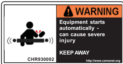
LOCATE AT ENTRANCE TO CONVEYOR WALKWAY

General warning to personnel that a conveyor's moving parts, which operate unguarded by necessity of function, i.e. belts, rollers, terminal pulleys, etc., create hazards to be avoided; in particular, conveyors which stop and start by automatic control near operator work stations would use this label.